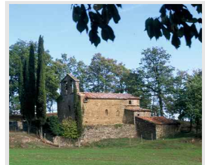
Sant Miquel Dosmunts Chapel.