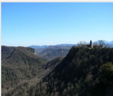
Cinglera of Cabrera.