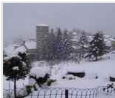
Molló covered with snow.