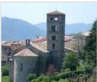
Santa Cecília de Molló.