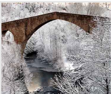
Sant Joan de les Abadesses Antique Bridge covered with snow.