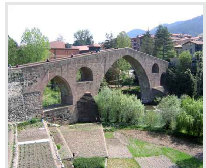
Sant Joan de les Abadesses Antique Bridge.