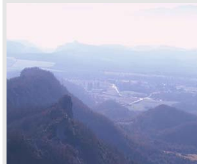
Foggy day in Osona.