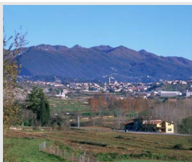
Sant Pere de Torelló.