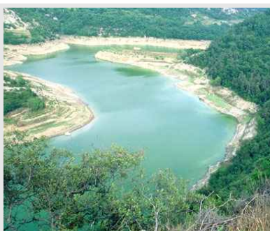
Daily view of Sau reservoir