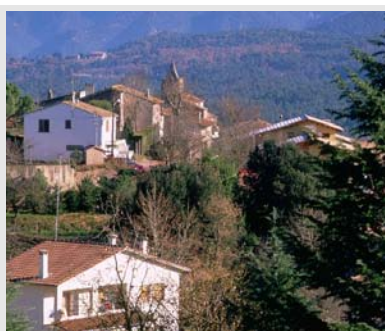
Vilanova de Sau