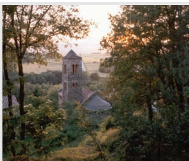
Sant Esteve de Tavèrnoles.