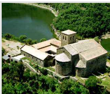
Monastery of Sant Pere de Casserres.