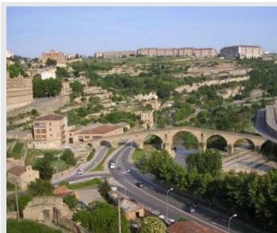
Image of Manresa.