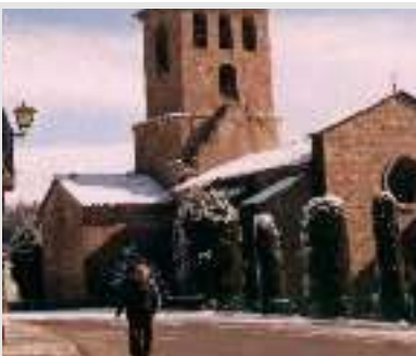
The Monastery of Estany.