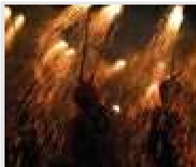
Correfoc in Artés.