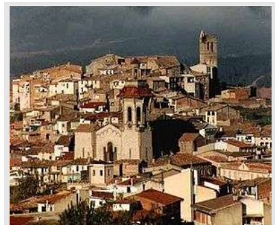
View of Artés.