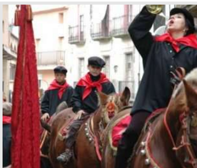
Sant Antoni in Artés.